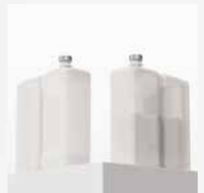
Without AAC With AAC

Reduce solvent consumption by up to 42% with built-in Active Airflow Control (AAC) technology option, for lower running costs and fewer solvent refills.