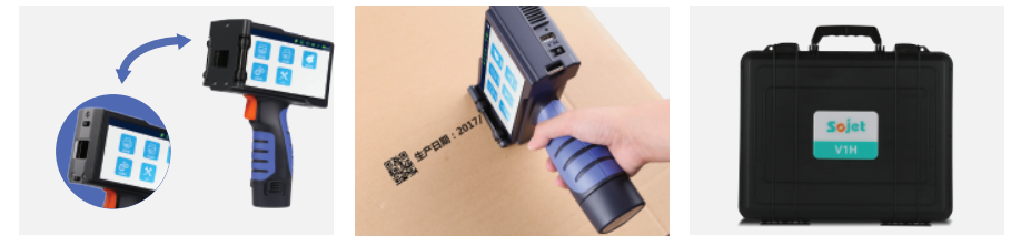
Two or four wheel options